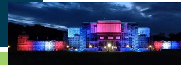
How incredible did Wentworth Woodhouse look this weekend? The Grade 1-listed mansion was lit up in red, white and blue to pay tribute on VE Day